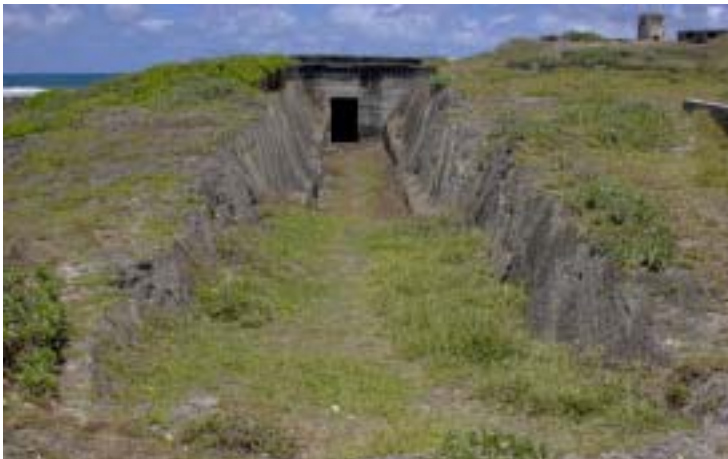
The enigmatic ditch and newly revealed graffiti were documented after vegetation had been cut back. (03jv2908)