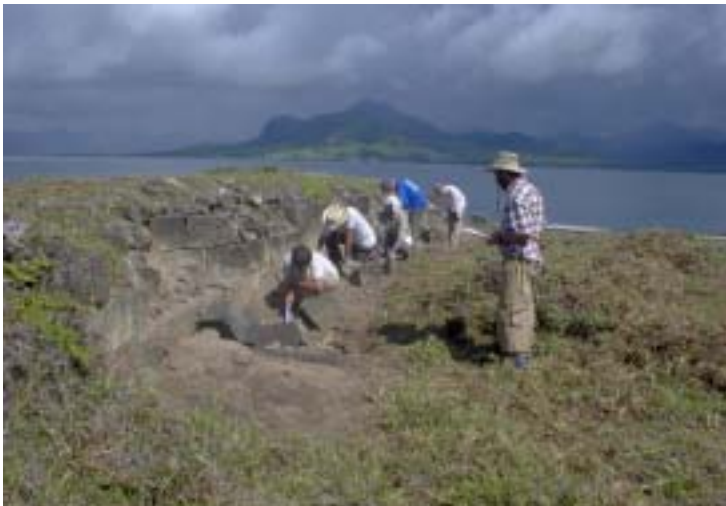
Team 1 clearing the parapet wall, emplacements and gun mountings on the Upper Battery. (03jv0202)