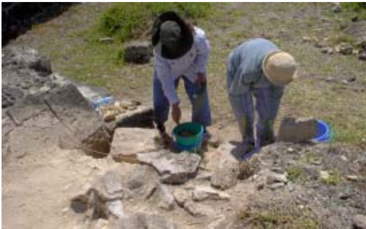
An exciting discovery was the sloping end of what might be a flagpole base seen in early French maps. (03jv1618)