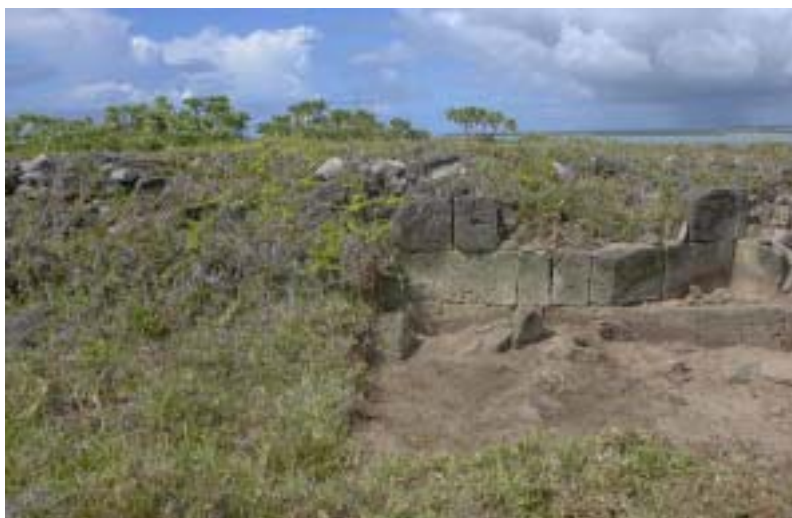
Full documentation can only be carried out after vegetation, rubbish and blown in sand has been cleared from in the front of the structures. (03jv0217)