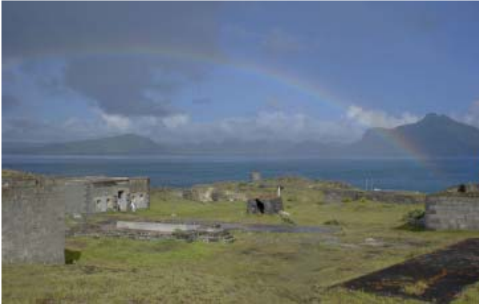
A pot of gold where the rainbow ends? (03jv0507)