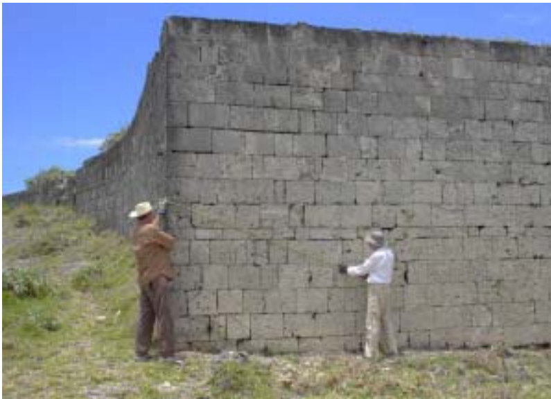
Earthwatch team members Roger and George measuring control points on the end wall of the Upper Battery for photo rectification. (03jv0113)