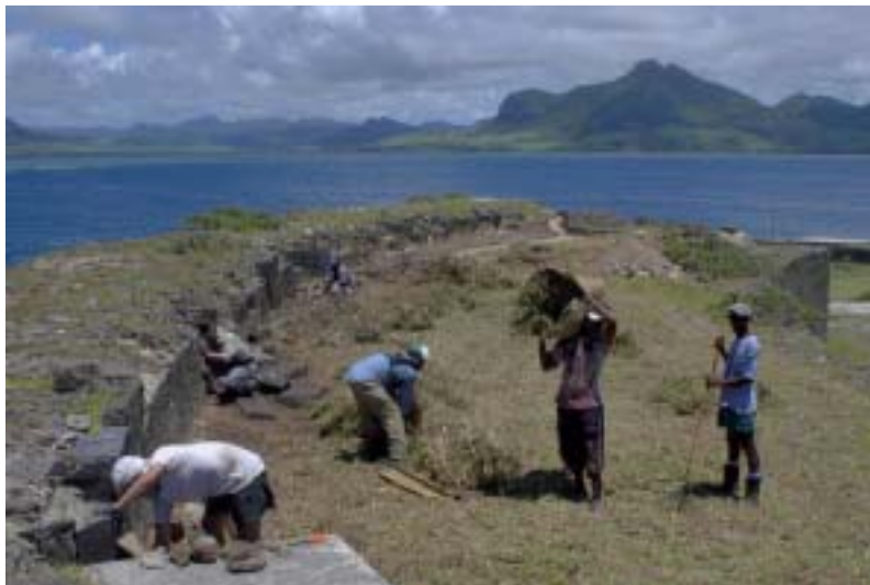
Volunteers clearing the monuments while local workmen dealt with the overgrown vegetation and accumulated rubbish. (03jv1308)