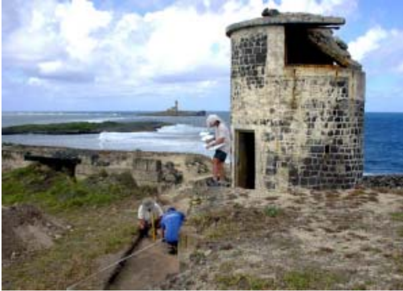
Once revealed, the structures were carefully planned and the position of displaced stones was recorded. (03jv1402)