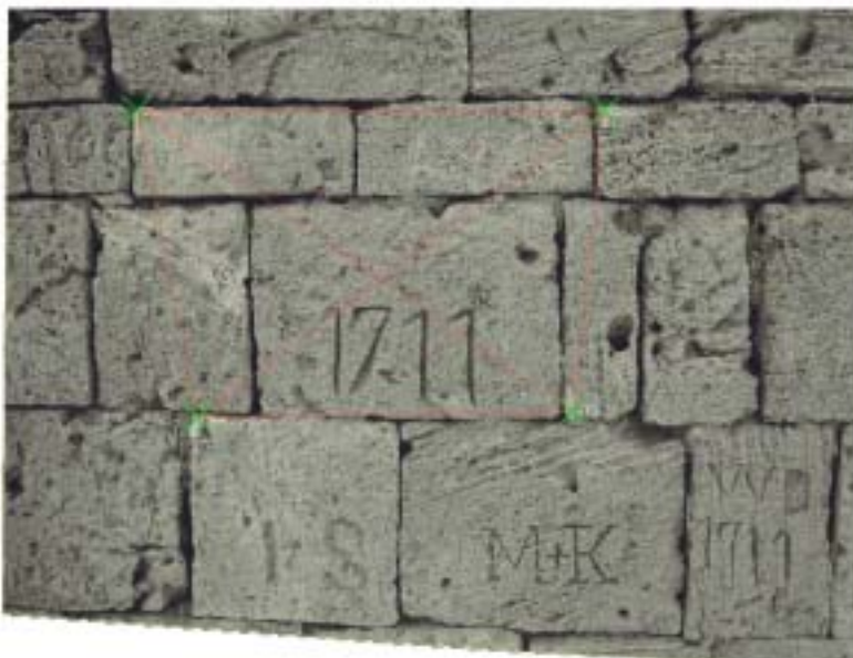
Rectified digital photo imported in AutoCAD to match control points.