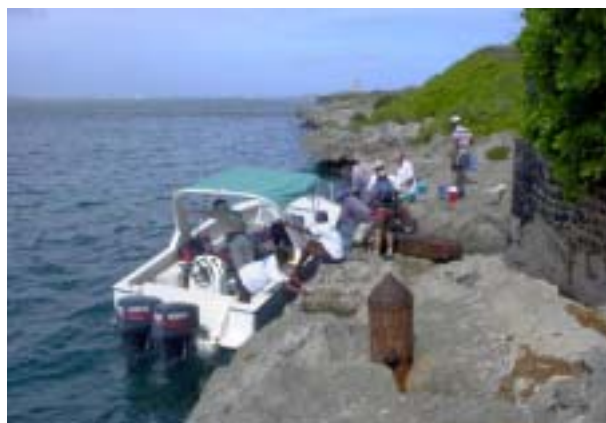
Team 1 disembarking on the islet. (03jv1215)

Ile de la Passe guards the entrance through the coral reef into Grand Port at the south-east of Mauritius. Control of this coral islet was the key to control of the Indian Ocean from the early 18 th century until 1810. The islet, pivotal in the last Napoleonic naval victory against the British at the "Battle of Grand Port", boasts some of the most impressive surviving examples of French military architecture in the southern hemisphere. Later British military installations are of considerable importance for the heritage of Mauritius and of interest to students of colonial history.