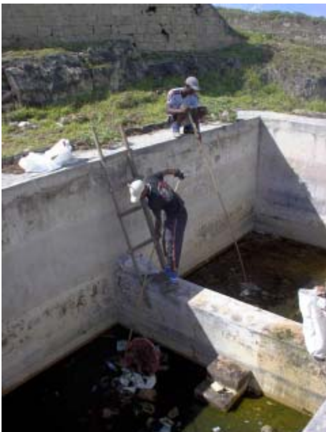
The workmen cleaned the cistern and collected rubbish from all over the island. (03jv1613)