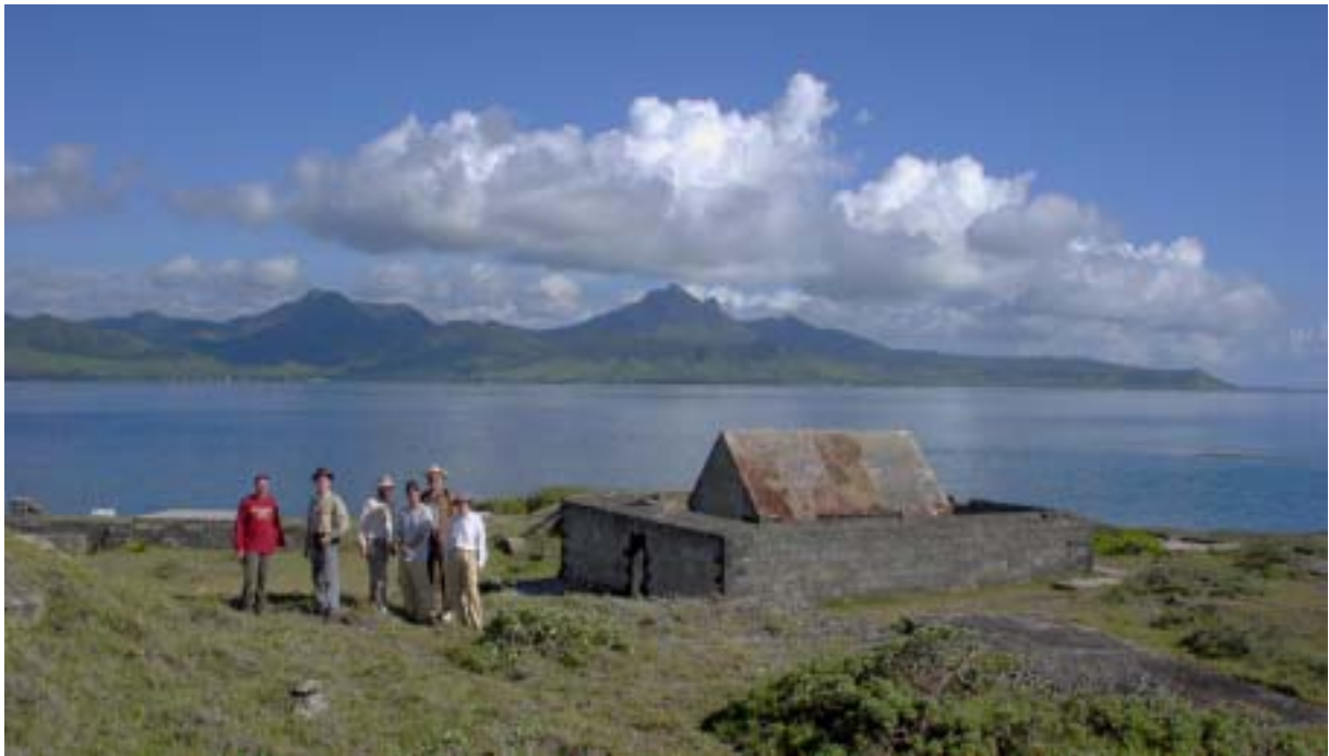
Earthwatch Team 1 on Ile de la Passe with the 18th century French Powder House behind. (03jv0101)