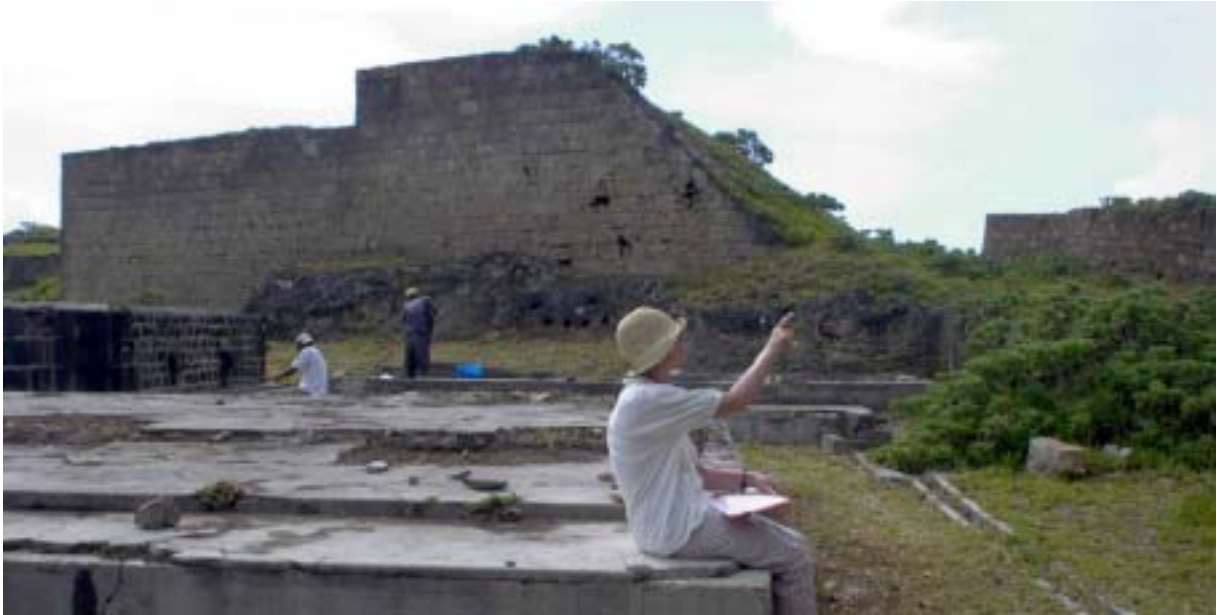
The NW end wall of the Upper Battery seen in the background. (03jv2002)