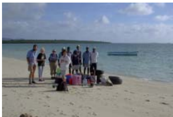
Team 2 and local workers awaiting the speedboat. Ile de la Passe can just be seen on the horizon at the extreme right. (03jv1812)