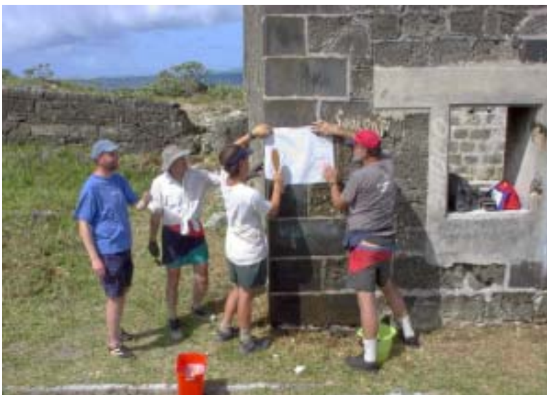
Team 1 learning how to make a squeeze but decided that it was not an easy task on a windy date! (03jv1401)