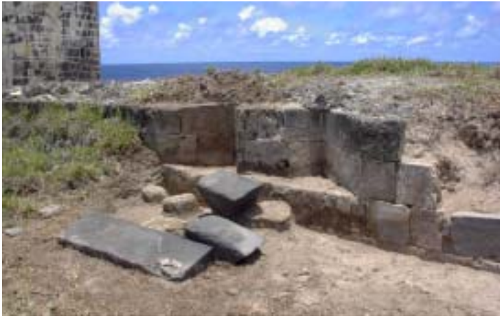
The first step was to clear the overgrown vegetation and blown sand so as to record the features revealed. (03jv0605)