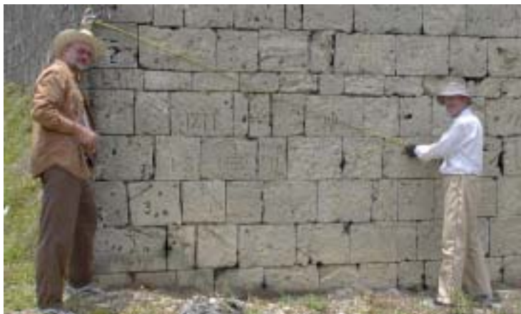
Roger and George measuring control points for photo rectification. (03jv0114)