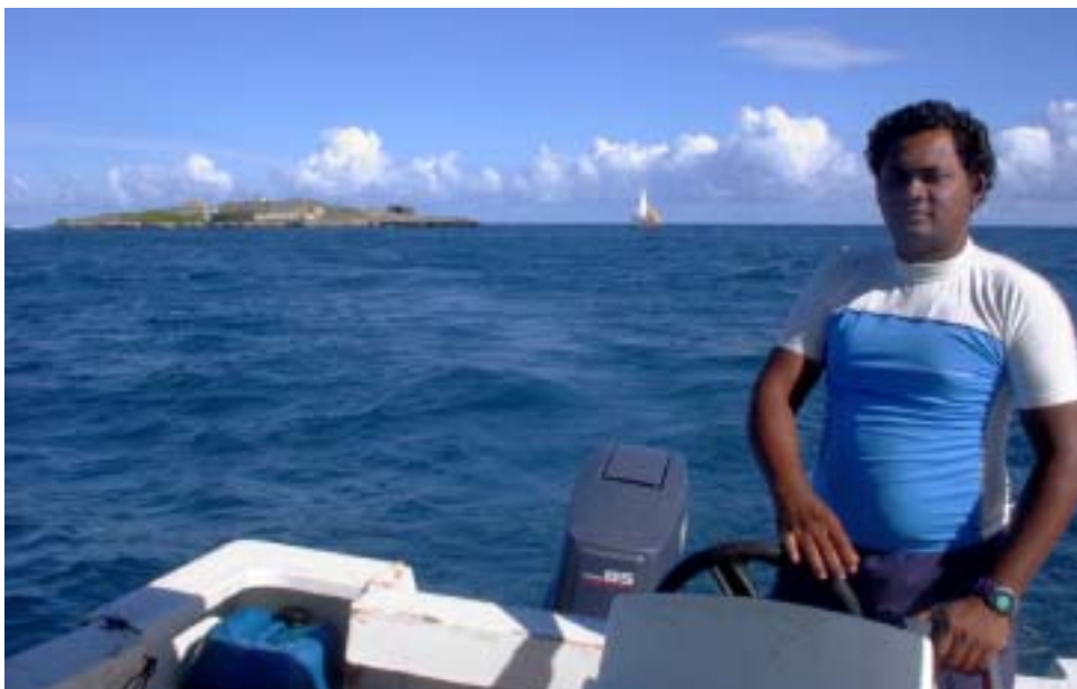
Ile de la Passe guards the channel into the Vieux Grand Port. (03jv1321)