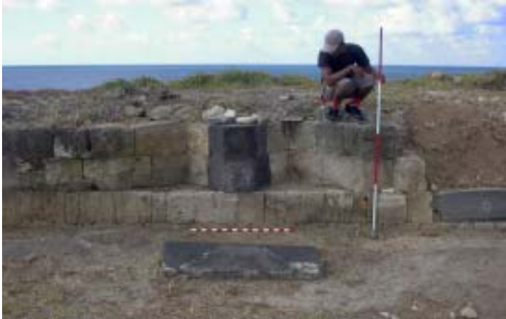
Some of the basalt stones were put back in place and where necessary a lime mortar, similar to the original one, was used. (03jv3510)