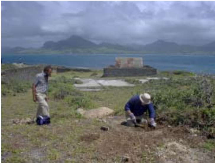
Zip cleaning sand from part of the Central Platform to reveal features that were unexpected. (03jv1617)