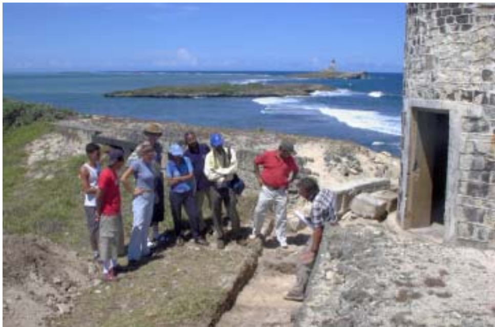
The Director of the National Heritage Trust and a group from the University of Mauritius were shown the progress made. (03jv1318)

A program of work and research for 2004 is being drawn up. This next season will concentrate on further clearance and restoration of the Upper Battery, the resolution of questions concerning the Central Platform and investigations in the Ditch.